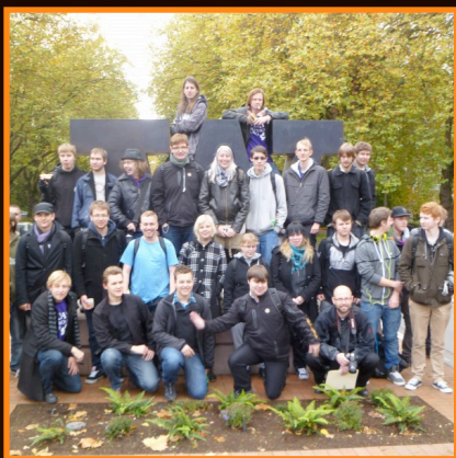
UNIVERSITY OF WASHINGTON SPONSORED